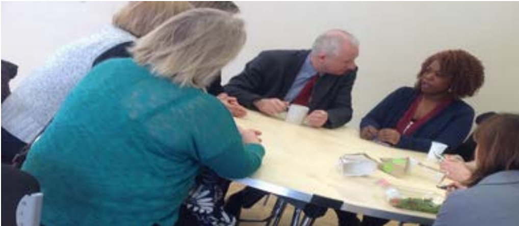
Left: Cambridge MP Daniel Zeichner chats to parents at our Cambridge City network meeting.