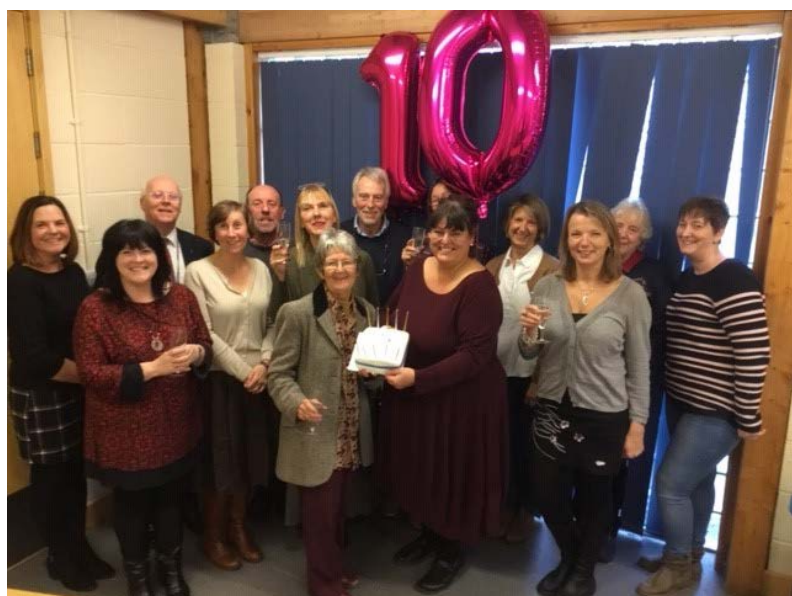
Past and current staff, volunteers and Trustees gathered to celebrate ten years of Pinpoint.

"The past year has been quite a journey for Pinpoint. New projects are underway alongside making sure that what has worked well for Pinpoint keeps on going. We are working hard to be a good 'critical friend' to statutory organisations, the County Council and Clinical Commissioning Group, by always taking a balanced approach but willing to address issues when children and families are not getting the best deal. The staff team has worked brilliantly together, and we are building our pool of active volunteer parents. Two parents have recently become trustees which is brilliant as we know we always have to be putting new energy into the organisation."