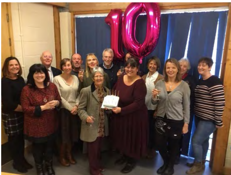
Past and current staff, volunteers and Trustees gathered to celebrate ten years of Pinpoint.

"The past year has been quite a journey for Pinpoint. New projects are underway alongside making sure that what has worked well for Pinpoint keeps on going. We are working hard to be a good 'critical friend' to statutory organisations, the County Council and Clinical Commissioning Group, by always taking a balanced approach but willing to address issues when children and families are not getting the best deal. The staff team has worked brilliantly together, and we are building our pool of active volunteer parents. Two parents have recently become trustees which is brilliant as we know we always have to be putting new energy into the organisation."